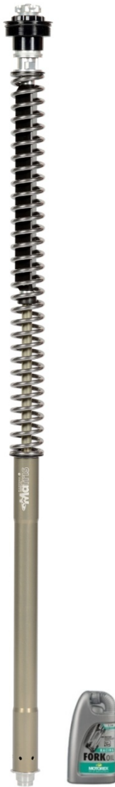
F25RX Fork kit

(*) single cartridge kit – Rebound & Spring Preload adjustment (right fork side only)